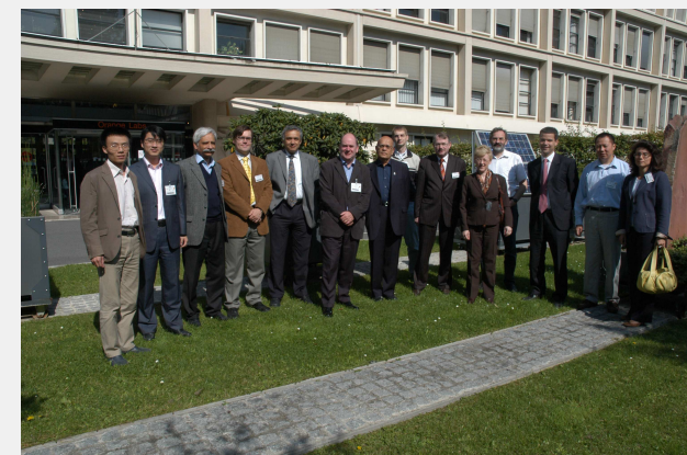
WWRF Steering Board